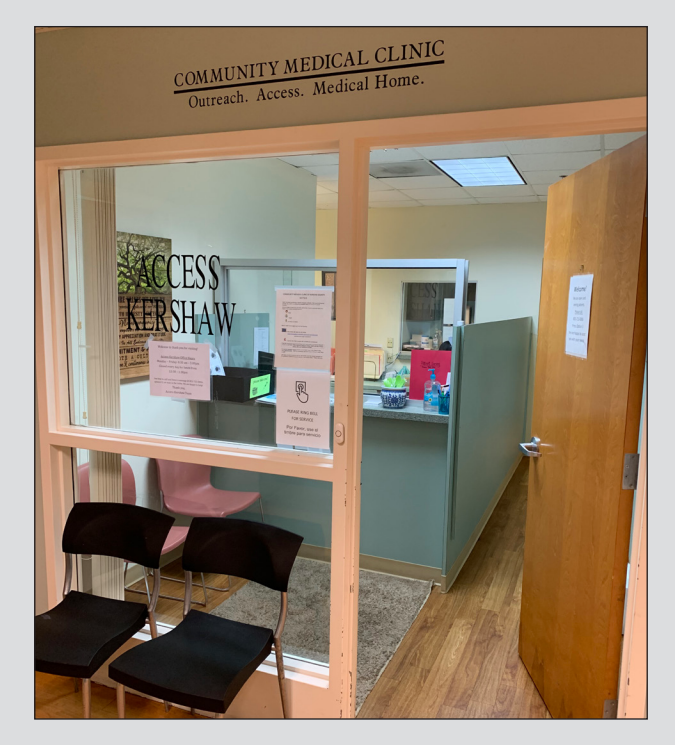
Access Kershaw main office in West Wateree Medical Complex.